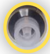
10ml Slip LOR Device